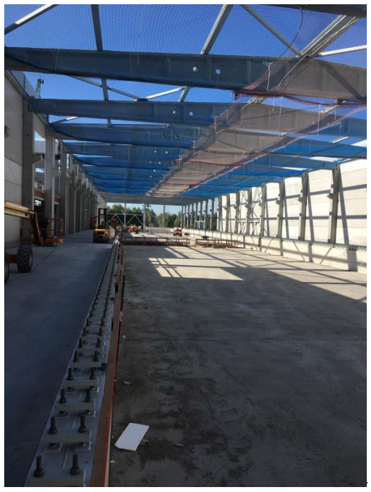
Coastal an Ocean Basis wharf

On June 26th, 2018 the young professionals visited the construction wharf of the new Coastal and Ocean Basis (COB) in Flanders . With this COB the Flemish government invests in a new maritime laboratory to study the impact of waves, tides and wind on ships and constructions at sea.