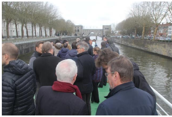
Sail under the "Ponts des Trous" bridge