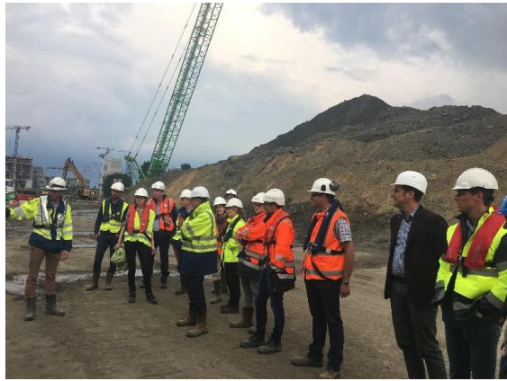
Renovation Quay wall Scheldt river

On June 26th, 2018 the young professionals visited the construction wharf of the new Coastal and Ocean Basis (COB) in Flanders . With this COB the Flemish government invests in a new maritime laboratory to study the impact of waves, tides and wind on ships and constructions at sea.