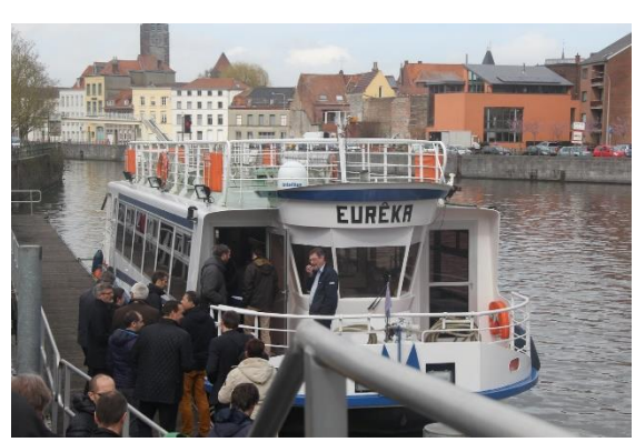
Embarkment on the Eureka on the river Scheldt