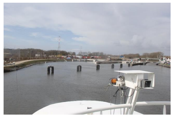
The Kain lock and barrier in the background.

The traditional summer event was organized September 7, 2018 in the COOP building at Brussels, the former milling Moulart along the Brussels - Charleroi Canal. From the top of this building you got a splendid view on Europe's capital.